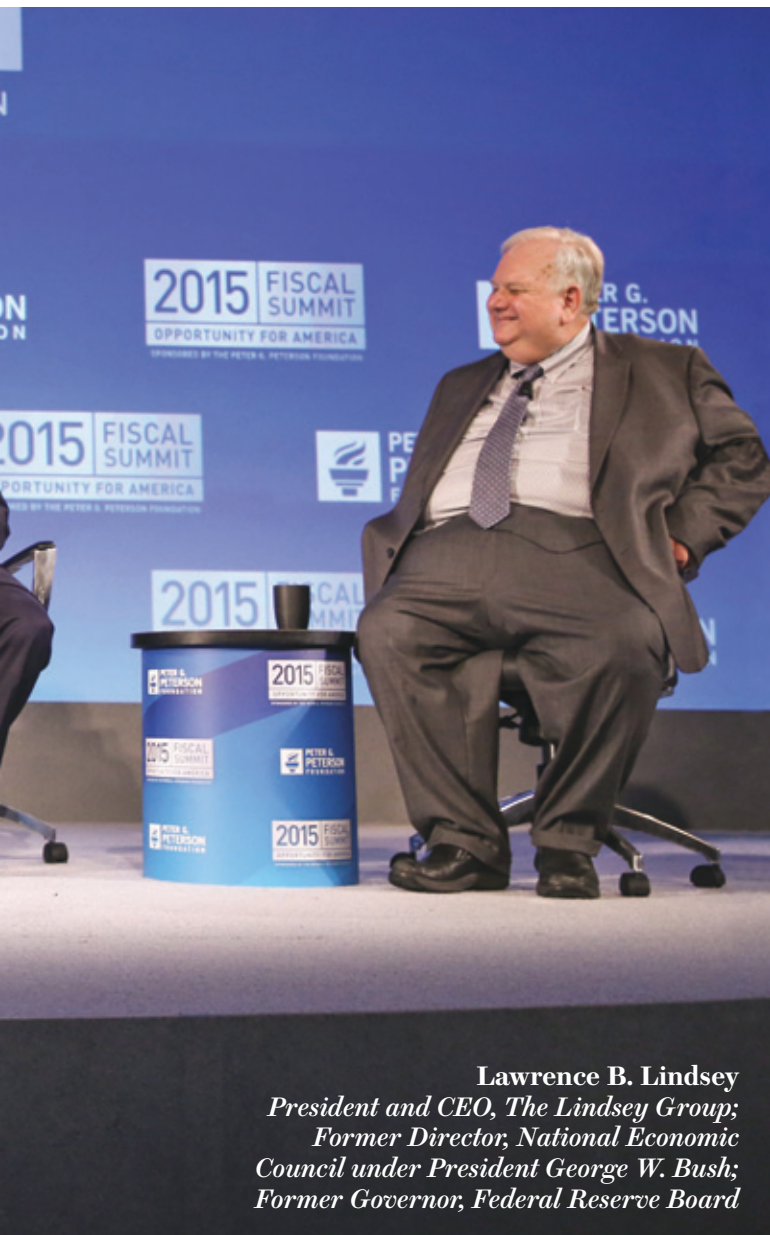
Lawrence B. Lindsey President and CEO, The Lindsey Group; Former Director, National Economic Council under President George W. Bush; Former Governor, Federal Reserve Board