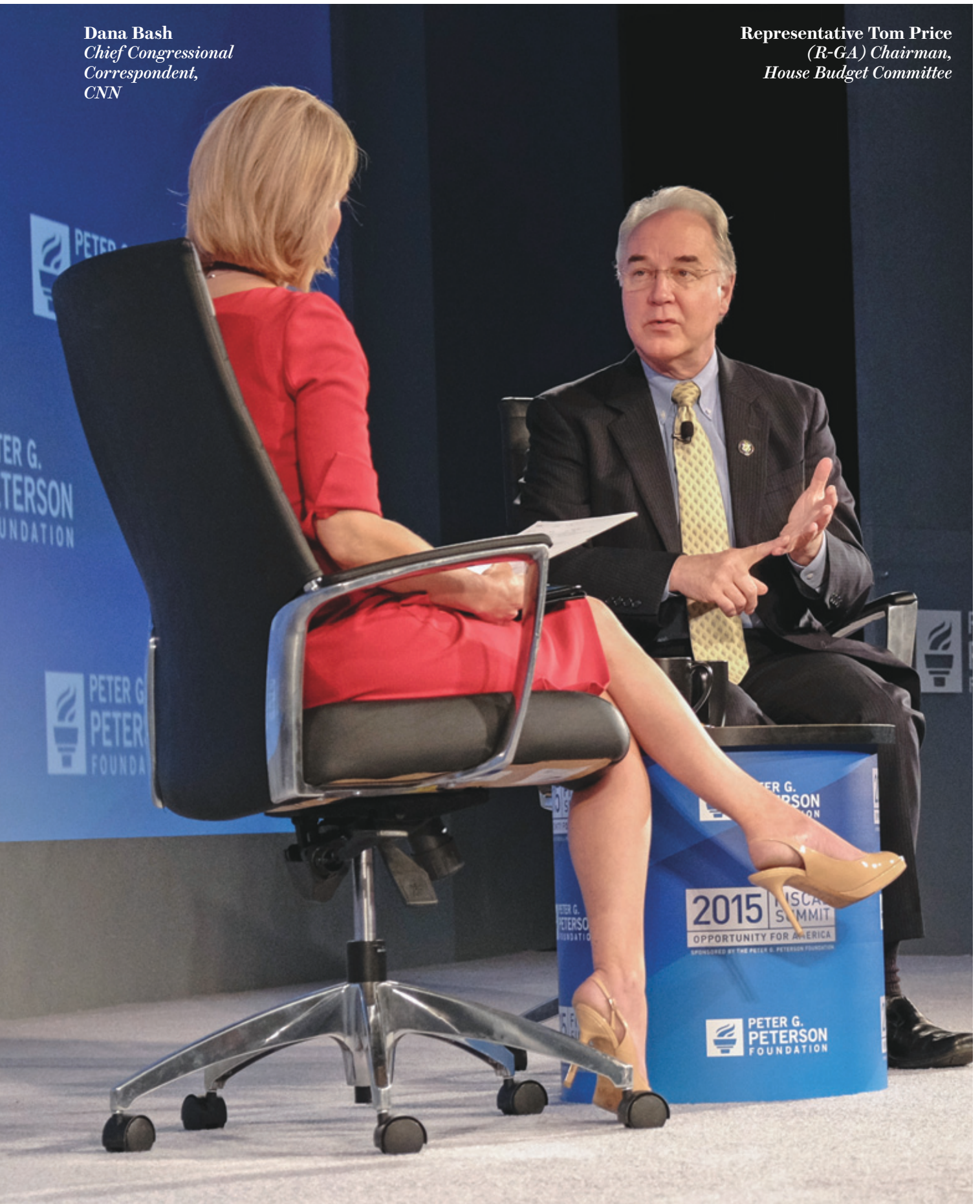
Representative Tom Price (R-GA) Chairman, House Budget Committee