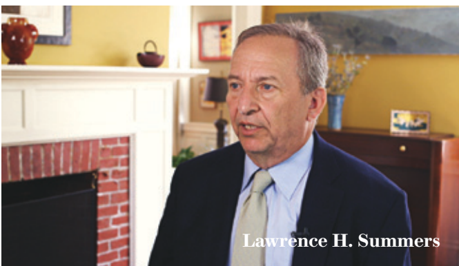
Lawrence H. Summers

“As a society, we’ve got a big choice to make. ... If we’re serious about opportunity for the future, we have to get our fiscal house in order.”