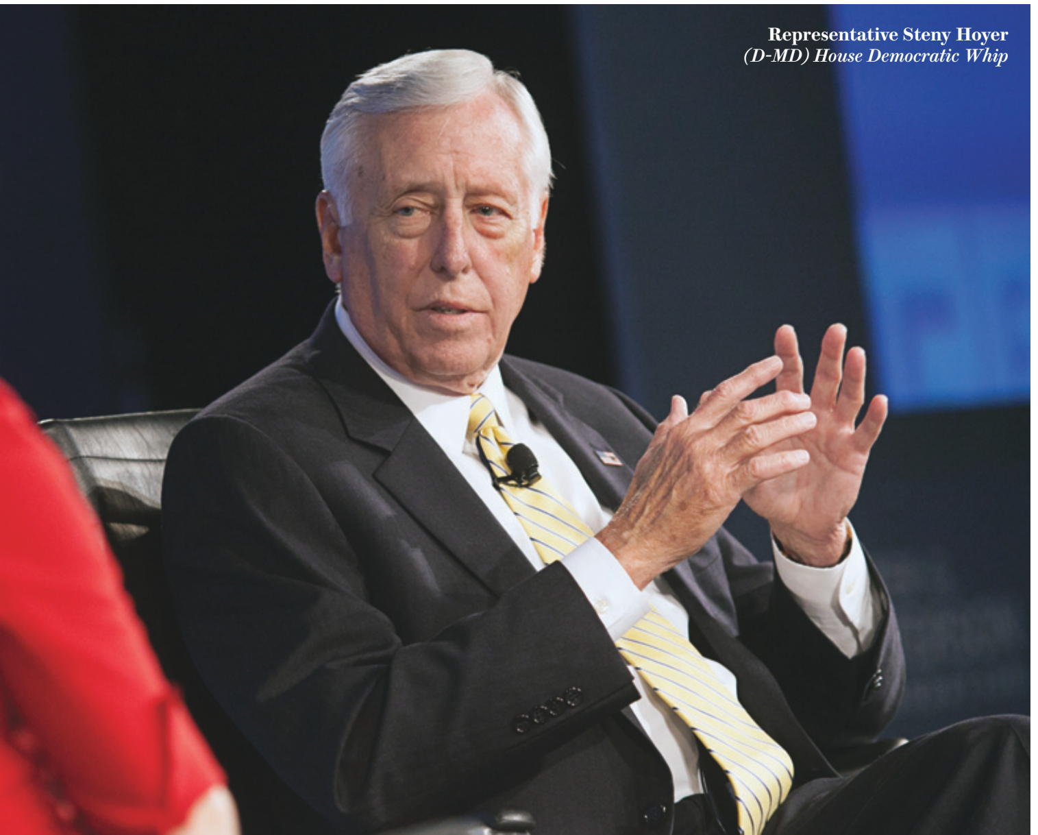
Representative Steny Hoyer (D-MD) House Democratic Whip