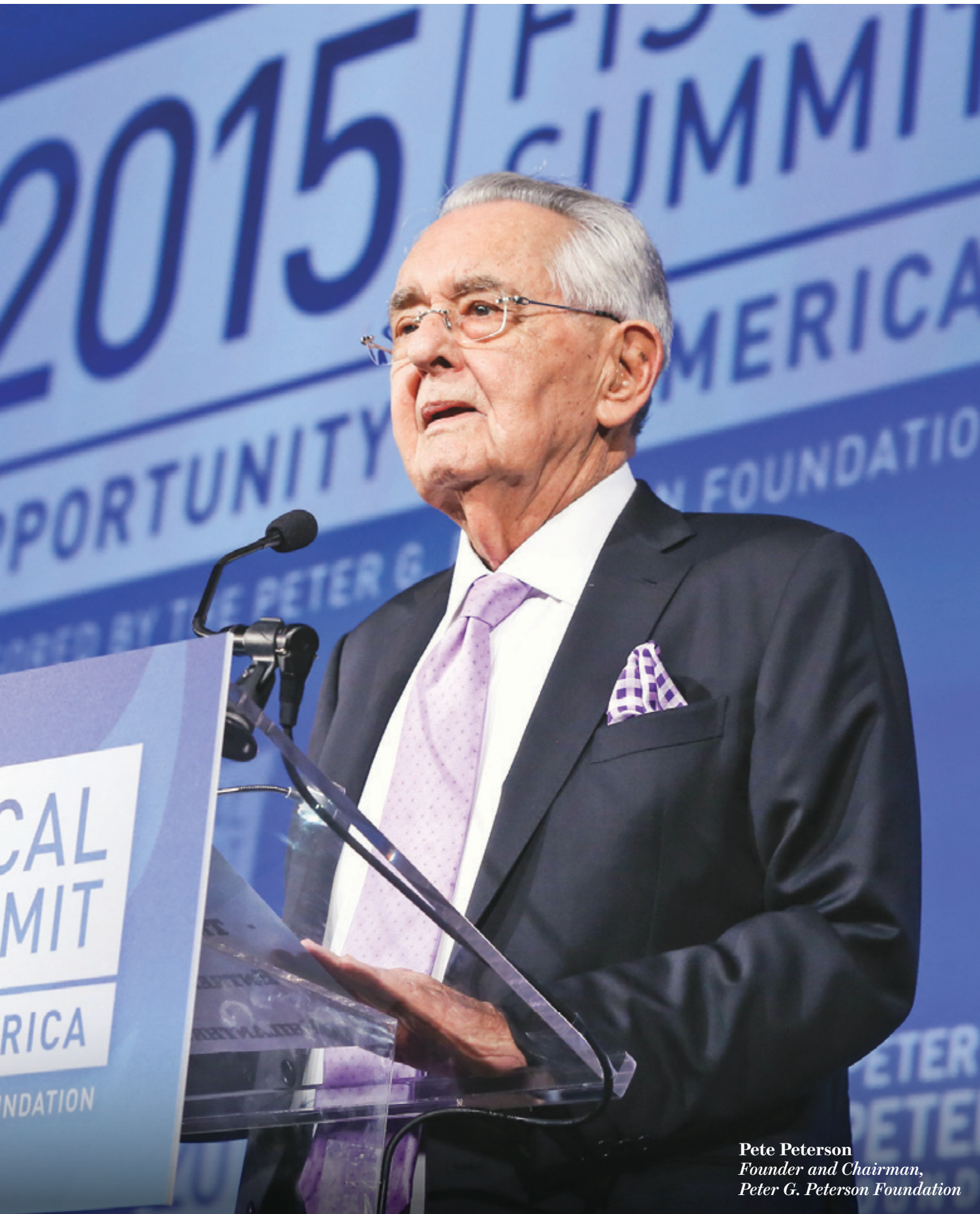
Pete Peterson Founder and Chairman, Peter G. Peterson Foundation