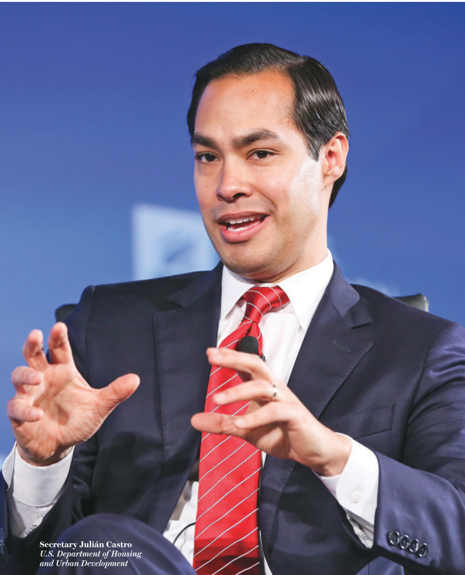
Secretary Julián Castro U.S. Department of Housing and Urban Development